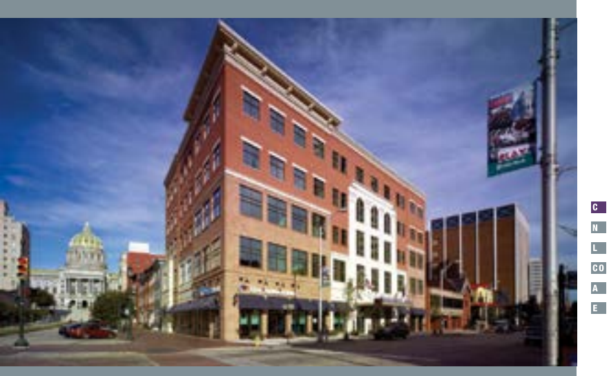
Navigating a site less than 3 feet from neighboring properties, the Warfel-led design-build team devised a pulley system for masonry work and developed an innovative geothermal system for this five-story LEED Gold office building.