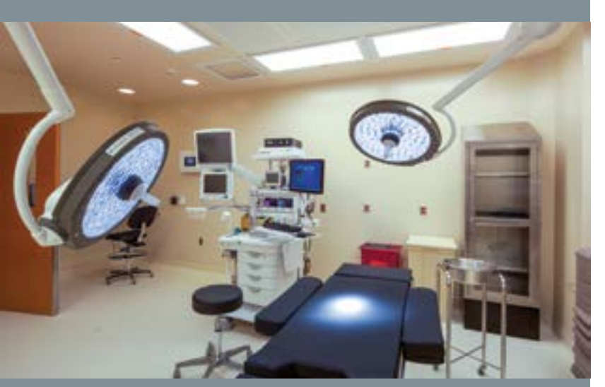
Working in an active hospital/medical center required SpawGlass to carefully monitor security, noise, and infection control while building 8,000 square feet of labor and delivery rooms and neonatal intensive care units.

General Contractor/ Construction Management Categories