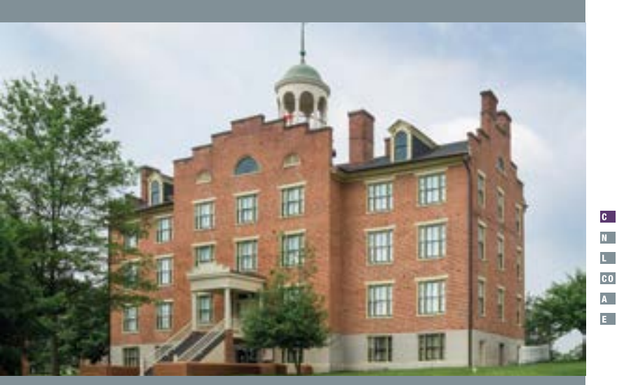
Morgan-Keller blended old with new on this LEED Silver museum by installing 40 geothermal wells and 900-pound timber support beams using mortise and tendon connections—meeting the strict 10-month schedule with zero accidents.

General Contractor/ Construction Management Categories