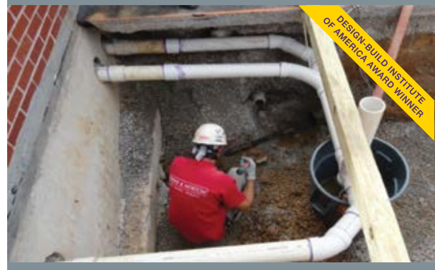
Early Services leveraged its design-build expertise to replace 155 feet of deteriorating sewer pipe in just two days using an innovative pipe bursting technique to save the owner more than $100,000.