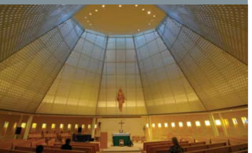
Landis brought to fruition the nearly century-old plan of St. Katharine Drexel and the acoustically precise design of Cesar Pelli for a 400-seat sanctuary with octagonal ceilings and a faceted copper roof.

General Contractor/ Construction Management Categories