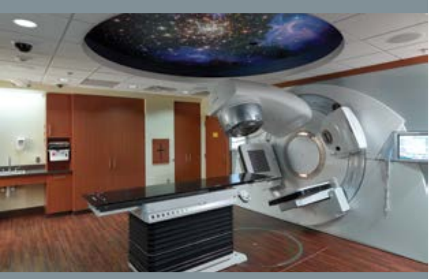
This five-story, LEED Gold cancer center was completed in 21 months despite challenges with excavating 200,000 cubic yards of earth and a fire at a neighboring building that required altering the project schedule.