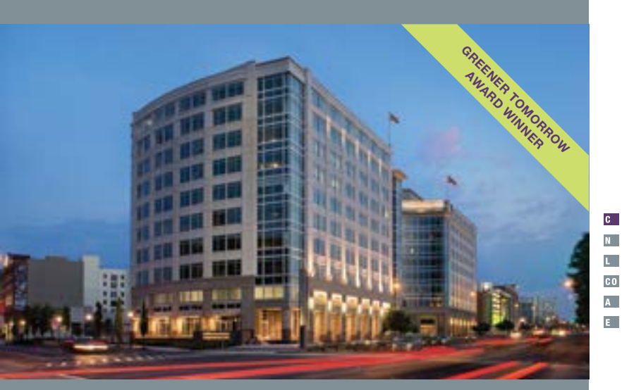
After falling six weeks behind due to heavy rainfall while excavating a below-grade garage, Foulger-Pratt used innovative scheduling techniques to begin interior finishes on time and get this LEED office project back on schedule.

General Contractor/ Construction Management Categories