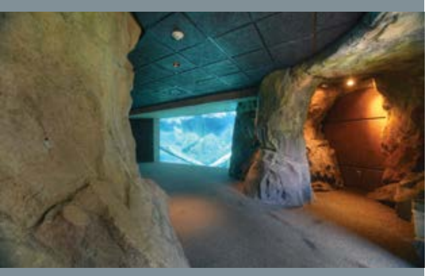
Forrester constructed a new seal and sea lion exhibit that includes six pools, ADA-compliant pathways, above- and below-ground water viewing areas, an amphitheater and a maintenance building that houses a life support system.