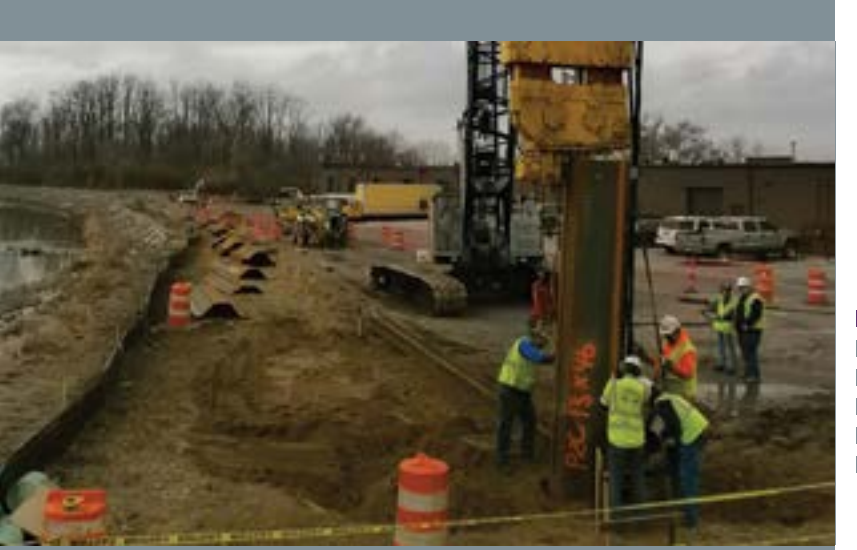
On its first prime contract with the USACE, Kwest Group safely dealt with overhead utilities and underground conflicts while constructing 2,600 traversing feet of customized reinforced concrete floodwalls partially located within 25 feet of surrounding businesses.