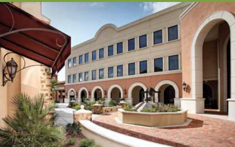
Middleman crafted this mixed-use development on a geologically challenging 11-acre site adjacent to a residential neighborhood, helping the design team with material selection to accommodate the Mexican Colonial village theme.