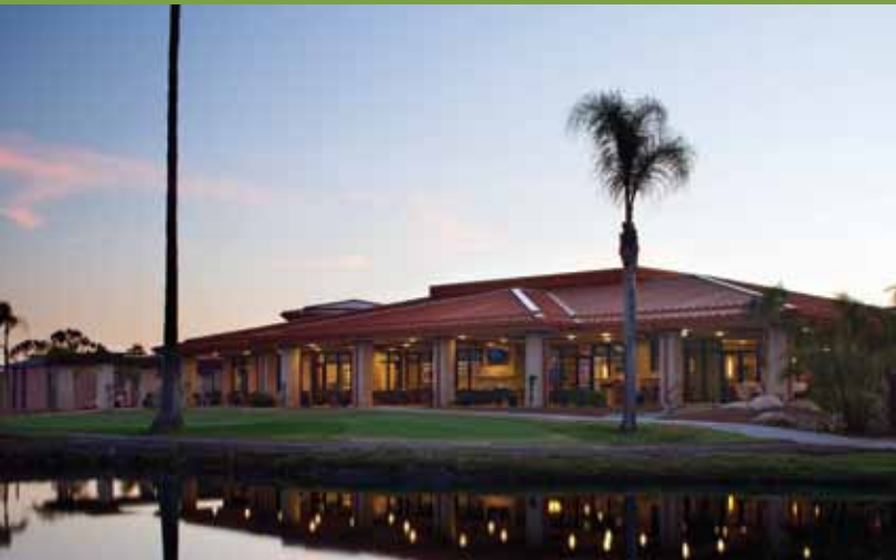
Teamwork was paramount on this $7 million golf clubhouse design-build venture in which Stronghold resolved $900,000 in cost overruns and exceeded the owner's LEED expectations to deliver a Gold-certified building.