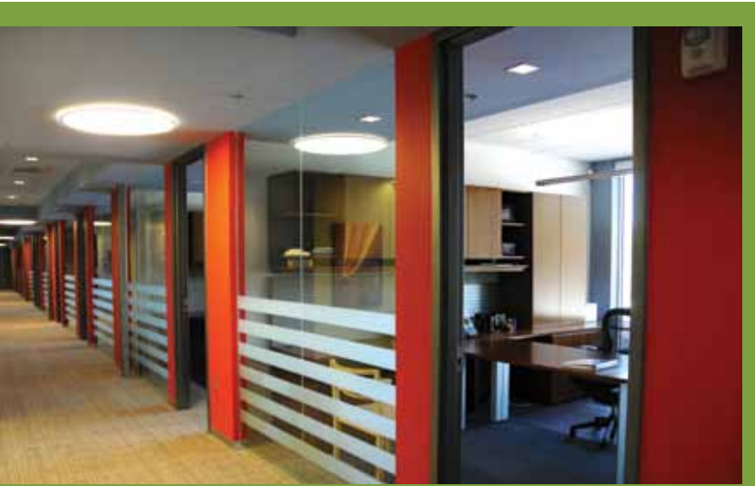
Hensel Phelps used the build-out of its new LEED Gold-qualified office to educate employees on green building and showcase the firm's talents with an architectural concrete wall in the lobby.