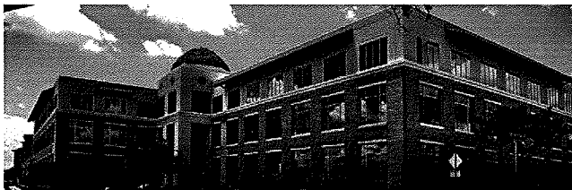
(3 story office building features architectural domes, decorative canopies, Viracon reflective glass, cast stone and brick veneer)

exterior. The interior of the office building has travertine tile floors custom quarried in Spain and handcrafted light fixtures. Also, the office has a state of the art computerized 42" touch-screen directory, mechanical energy management, building automation system, and a controlled-access system to facilitate off-site property management.