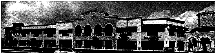
(Section of the 2 story retail center features architectural effects such as stone archways and columns to enhance the Tuscan theme)

The project, situated on a 10 acre site, consisted of a three story office building (100,000 sq.ft.) with a five story parking garage (168,000 sq.ft./ 500 space), two story retail center (92,000 sq.ft.), and two out-parcel retail buildings (25,000 sq.ft.) located across a newly constructed 60' public roadway. The development is tied together by a pair of La Arcata landmarks placed directly on the corner of Tuscany Stone and Loop 1604 and built to resemble an ancient Roman aqueduct system in disrepair but providing a gateway to the development. Construction began in September 2005 and was completed September 2007.