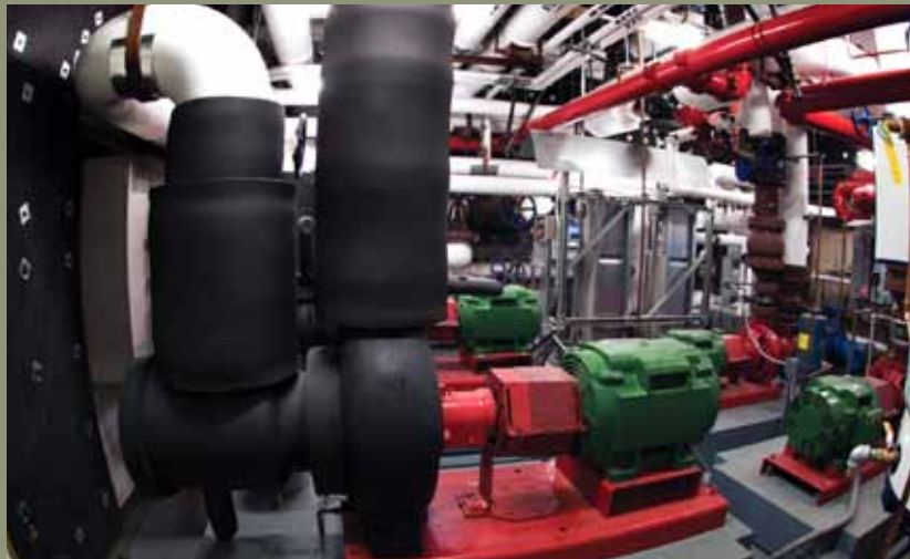
After this symphony hall suffered major flood damage, crews worked 24 hours a day to remove MEP systems piecemeal through an eight-by-eight-foot opening, as well as install new equipment and implement a flood protection plan.