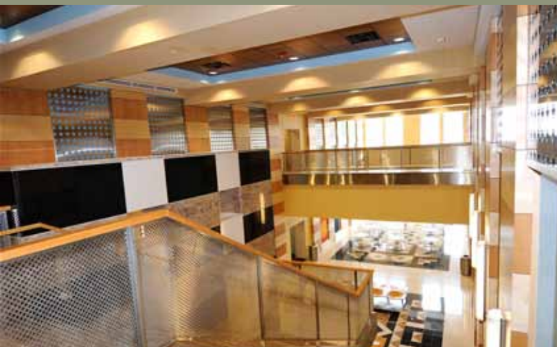
B.L. Harbert overcame unique challenges, such as working through the Islamic holy month of Ramadan in 130-degree temperatures, to complete this LEED Gold-certified U.S. consulate in Dubai four months early.