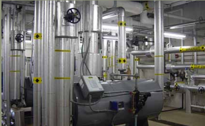
M&D Mechanical filled the second story of this 83,000-square-foot LEED Silver office and laboratory building with custom built air handling units, including one measuring 46 feet long and 15 feet high.