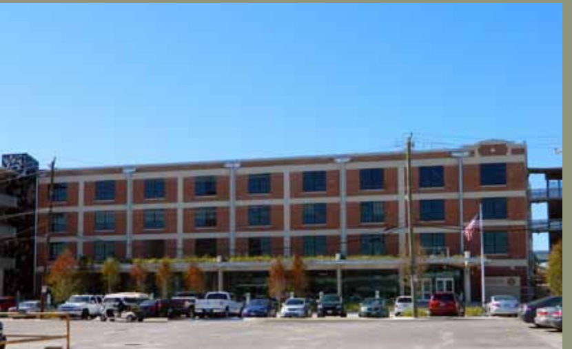
Due to unforeseen deterioration, Chamberlin patched 380 percent more of the exterior façade than originally estimated while performing a 10-month triple wythe masonry restoration for this LEED Gold city building.