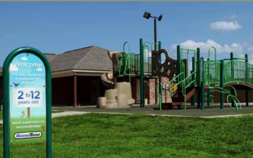
Bennett Builders safely completed a 95,865-square-foot single-family housing development that incorporated 43 rental homes and nine floor plans two months ahead of the 10-month schedule.