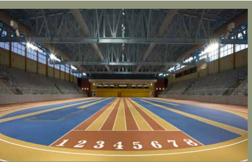
Phased bid packages and BIM coordination software helped Brasfield & Gorrie stay on schedule to deliver this LEED-certified indoor track and Olympic-size pool facility.