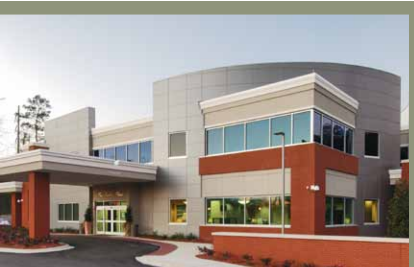
Routine quality inspections and the use of building information modeling allowed Robins & Morton to complete this two-story, 52,000-square-foot cancer center on time with LEED Silver certification.