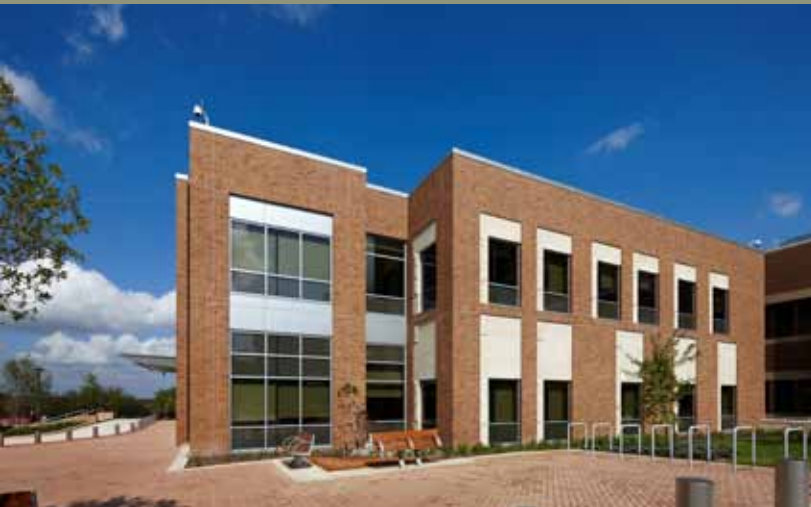
Building information modeling helped Robins & Morton complete this $39 million rehabilitation center ahead of schedule and under budget, while incorporating elements specific to healing injured soldiers.