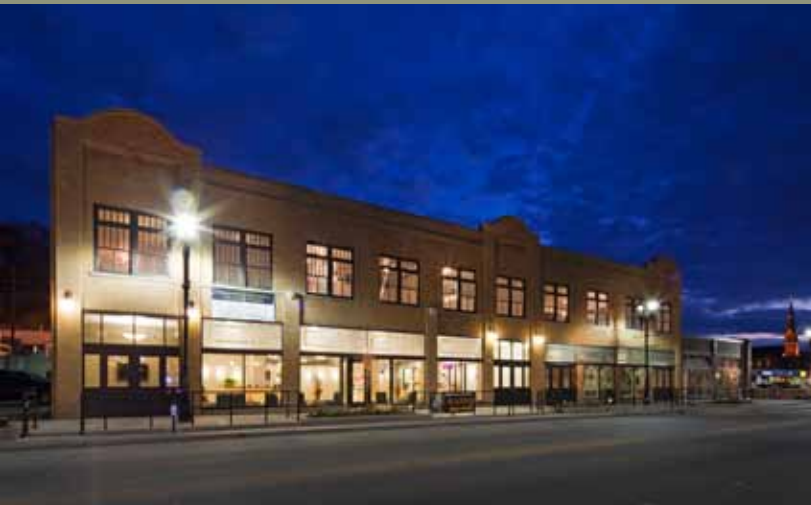
Lund-Ross performed interior demolition, structural repairs, and façade, flooring and window restorations to turn a 94-year-old auto dealership into high-end residential and commercial space.