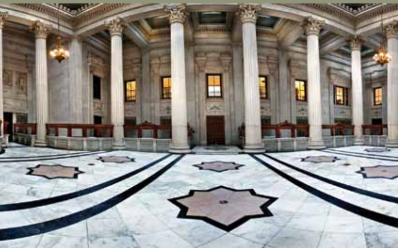
Teamwork was the key to Gibbs' successful 20-month restoration and sustainable modernization of this 19th century federal government building that occupies a city block in New Orleans.