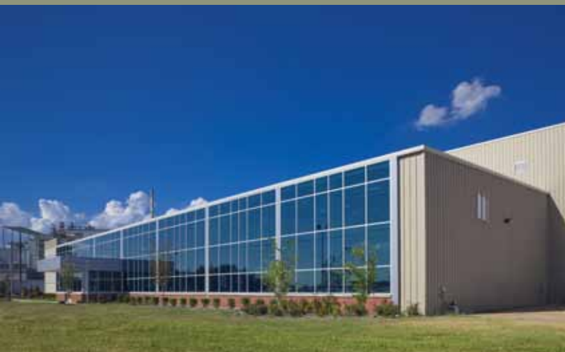
For this eight-month design-build project, Crain married pre-engineered and traditional structural steel buildings to create a 52,750-square-foot equipment platform and research development center for a manufacturing facility.