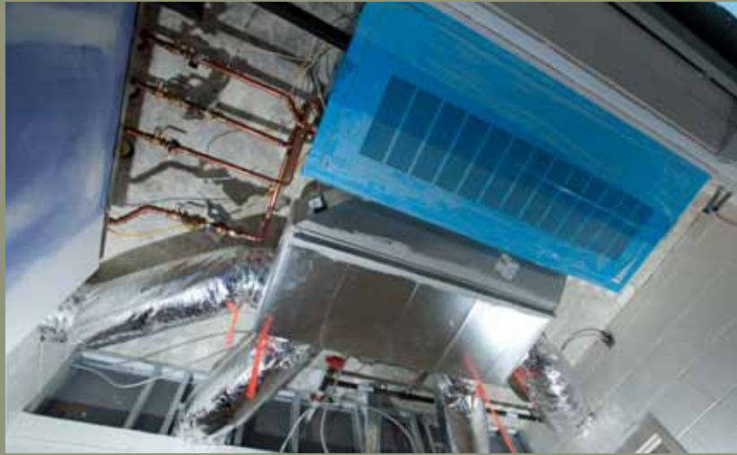
Waldrop completed mechanical renovations for two residence halls at Wofford College within a tight 12-week time frame—despite a 14-day delay following the discovery of asbestos.