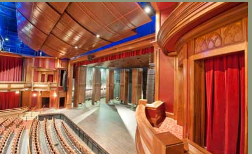
Ingram implemented creative field engineering and coordination with MEP subcontractors while performing framing, insulation, sealant, plaster and ceiling work on this $38 million LEED Gold concert hall renovation and addition.