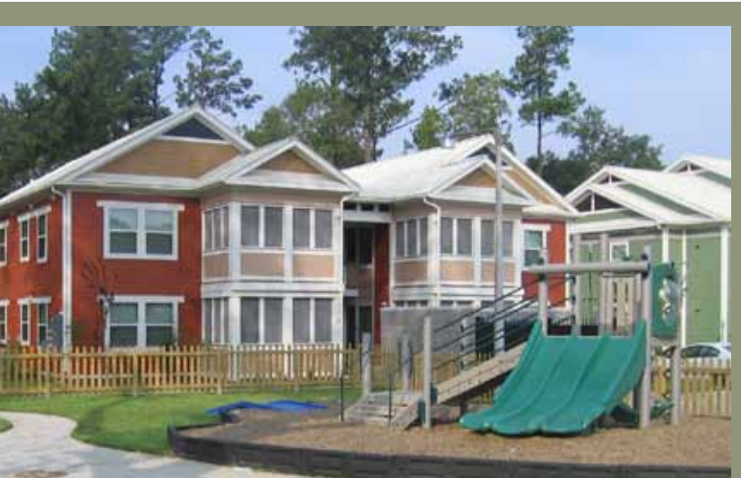
DonahueFavret completed this 94-unit housing development for mixed-income families ahead of schedule and under budget in an area of New Orleans decimated by Hurricane Katrina.