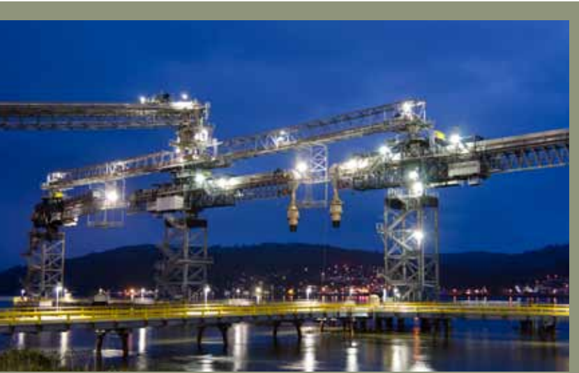
Interstates executed a $15.7 million design-build electrical contract for the first U.S. grain export terminal constructed in more than 20 years, using lean systems and offsite prefabrication to prevent congestion onsite.