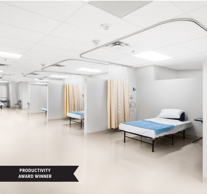
PRODUCTIVITY AWARD WINNER