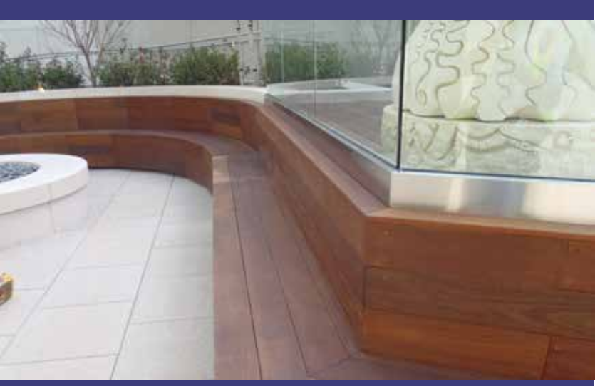
KPost successfully completed 10 roofing and building envelope systems in three primary areas of the 23-story Omni Dallas Convention Center Hotel—the equivalent of 23 unique roof assemblies.