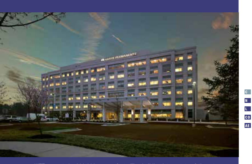
HITT converted a 200,000-square-foot office building into a state-of-the-art medical center, following an aggressive schedule that entailed workflow changes and installing a 10,000-pound MRI through a window.

General Contractor/ Construction Management Categories