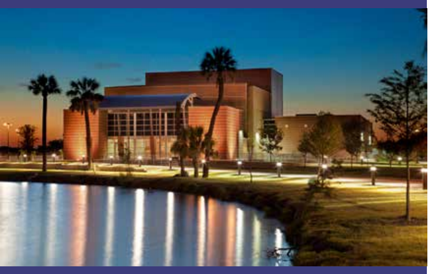
Architecture students were regular jobsite visitors while SpawGlass worked toward an on-time completion of this high school's new fine arts facility, which features an auditorium with acoustical ceiling and wall panels.