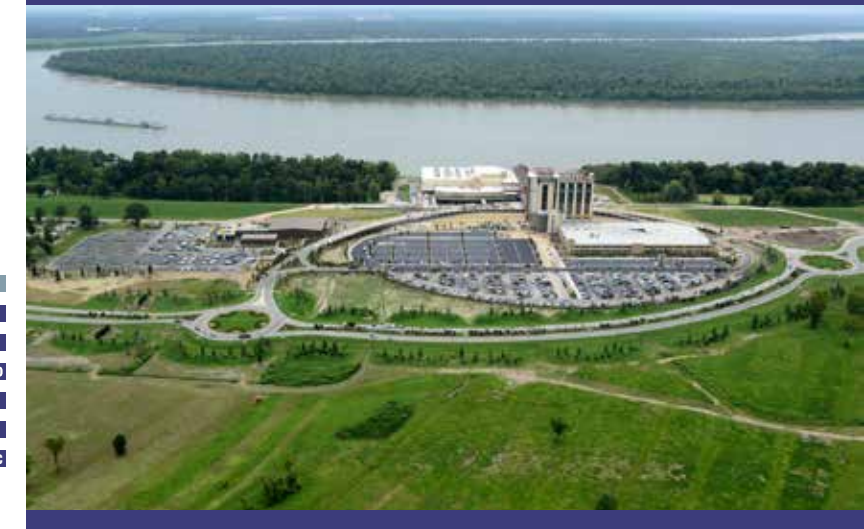
Durr was contracted to excavate the side of a levee along the Mississippi River to provide an enclosure for this floating casino, with river elevations reaching record highs twice during the project.