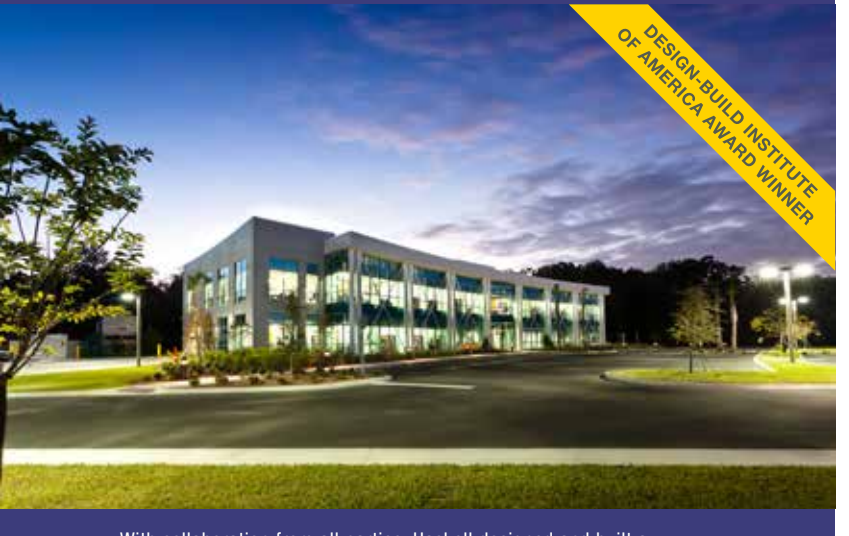
With collaboration from all parties, Haskell designed and built a 33,455-square-foot, LEED Silver headquarters for NCCER featuring cutting-edge technology and high-efficiency energy systems.