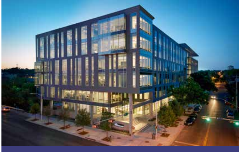
Tight site conditions on this six-story office building with a connected eight-story parking garage required Harvey-Cleary to schedule and stage lot-line to lot-line concrete pours in a busy downtown residential area.