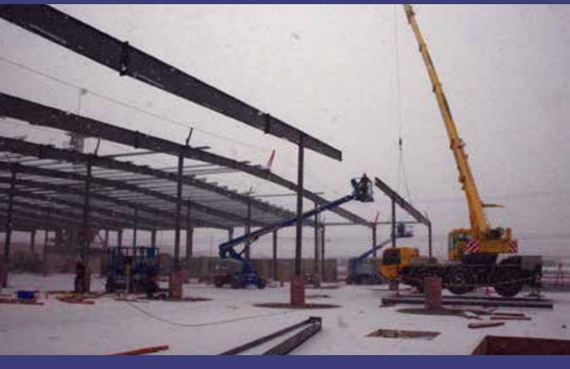
After a fire destroyed the Cargill Feed Mill, Keystruct worked to rebuild the 90,750-square-foot facility with interior structures that double the mill's production volume while preventing future fire hazards.