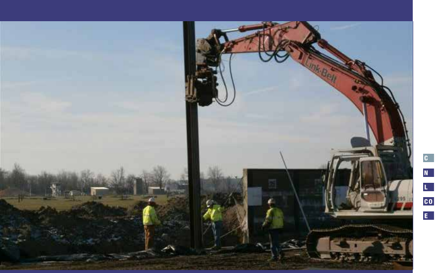
Kwest completed the reconstruction of a 100-year-old firing range berm ahead of schedule even though work began during one of the wettest periods on record in Northern Ohio, leading to critical path activity delays.