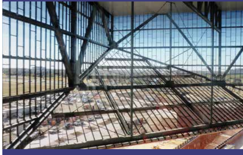
This LEED Silver convention center's angles, slopes and high ceilings required precision and innovation from LASCO during the 13-month project, which finished ahead of schedule.