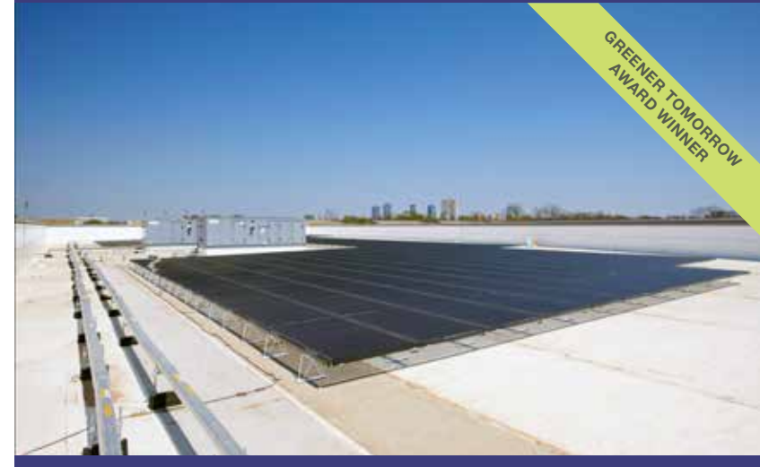
TDIndustries performed mechanical and plumbing work on this twostory, LEED Platinum office building, resulting in an estimated 50 percent reduction in energy consumption.